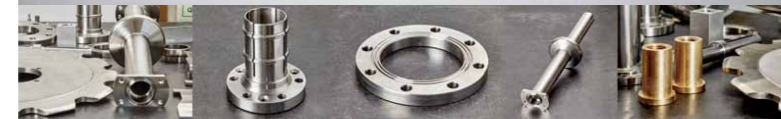
FLANGES, SPROCKET-WHEELS, VALVES, SUPPORTS