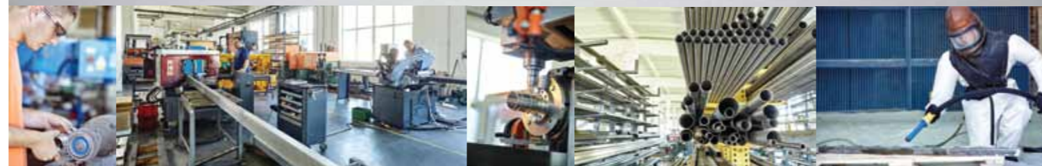
GLASSBLASTING, SATINATION, DRILLING, DEBURRING, SAW-CUTTING, SHEER-CUTTING, BELT-POLISHING