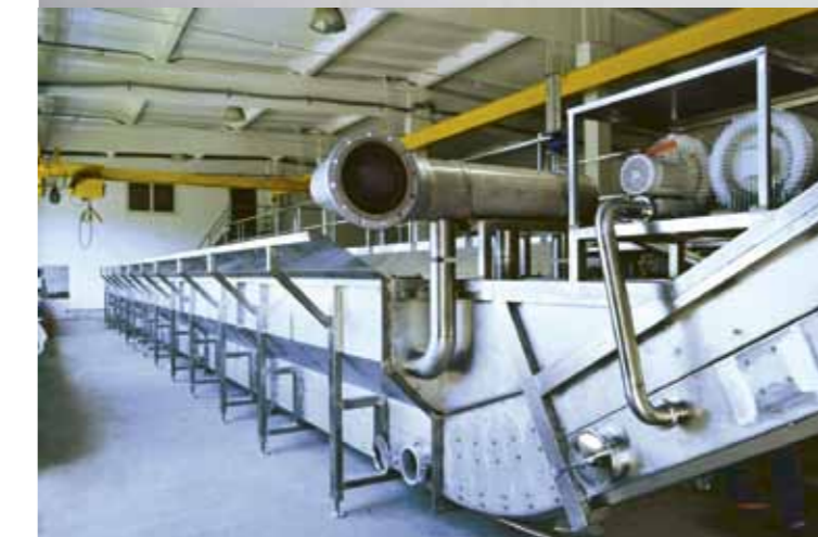
TUNELS FOR WASHING OF FRUITS AND VEGETABLES